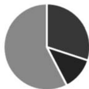
Person-to-Person Contact with the Poor 22,435

These charts are a quick snapshot of our service to neighbors and the money spent to help them. We cannot do this without you! Thank you for your generous support.