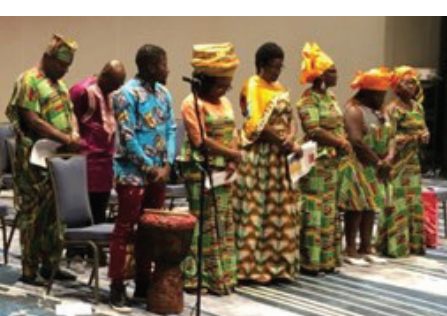
Queen of Peace Parish African Choir

DID YOU KNOW? Payday lending involves small-dollar, high-interest loans that trap consumers into a long-term cycle of debt and fees. Payday lenders tout themselves as a needed service providing access to emergency credit. However, the payday loan model creates a debt trap that is easy to get into, but it is extremely difficult to escape. The passage of Proposition 111 last year significantly limited payday lenders' ability to charge high fees, but payday loan interest rates can still be as high as 36% under the new law. Fortunately, the Fresh Start Loan Program offered by the Society of St. Vincent de Paul allows our neighbors to replace high cost payday loans with very low cost loans (less than 5%) from our partner, Fidelis Catholic Credit Union. If you know of a neighbor who has been caught in the vicious cycle of a payday loan, refer them to your local SVdP conference. Thus far, we have helped several neighbors replace a total of $5,000 in payday loans with a like amount of low-cost loans from Fidelis, and we have the capacity to help many more!