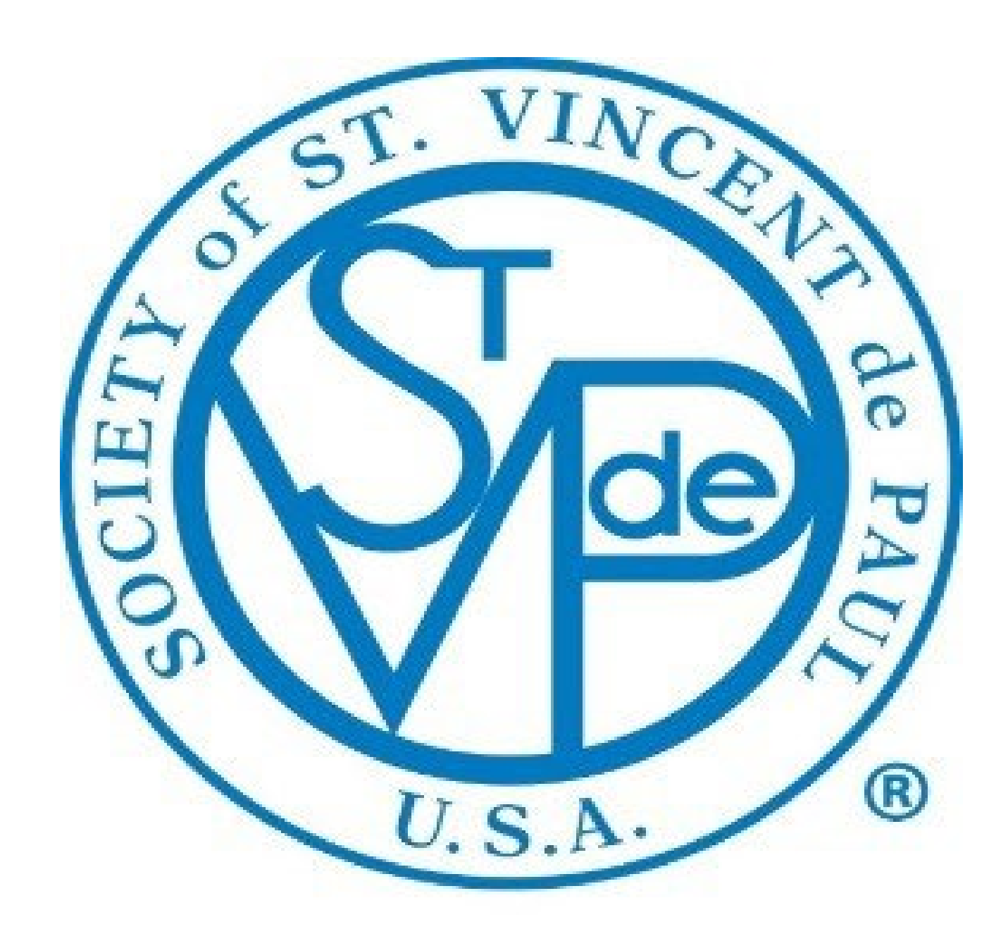
Denver Metro Council Safeguarding